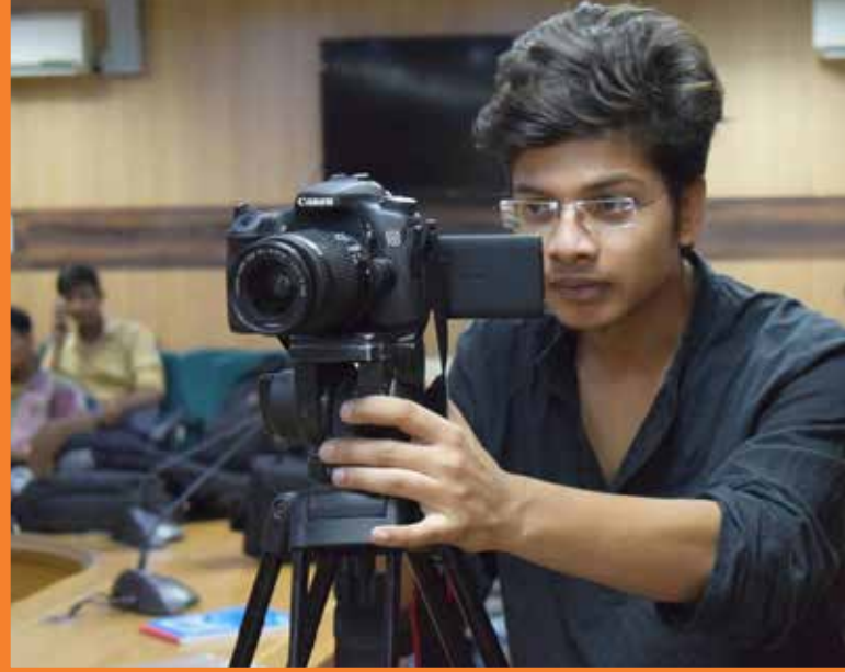
Students in action: live projects