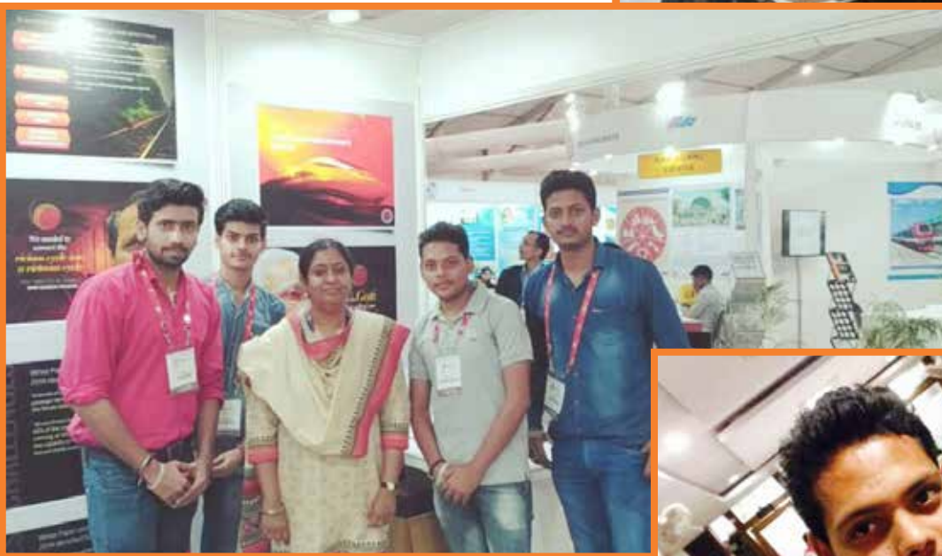
Students with their 'Industry mentor'