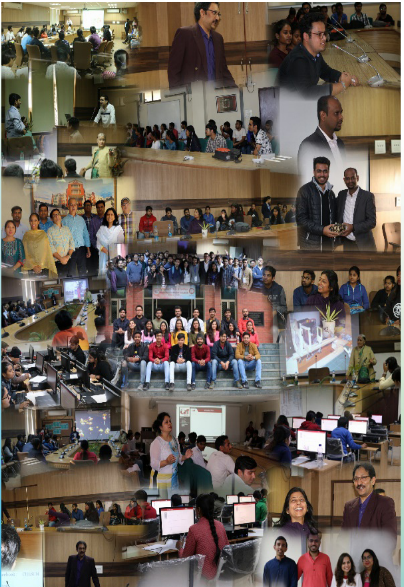
THE TRAINING & PLACEMENT CELL 2018-19